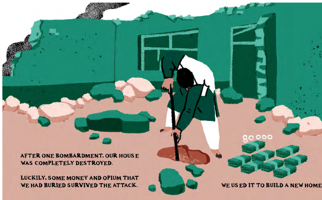
Above: From Jangul: Conflict and trafficking in Afghanistan's borderlands , Positive Negatives, 2020.

As well as providing a lifeline for individuals, the illicit drug economy can be a source of public goods where the State fails to provide them. For example, in Puerto Asís, Colombia, one respondent described how the proceeds from coca cultivation were used by small-scale growers to collectively fund a schoolteacher before a teacher was eventually appointed and paid by the State.