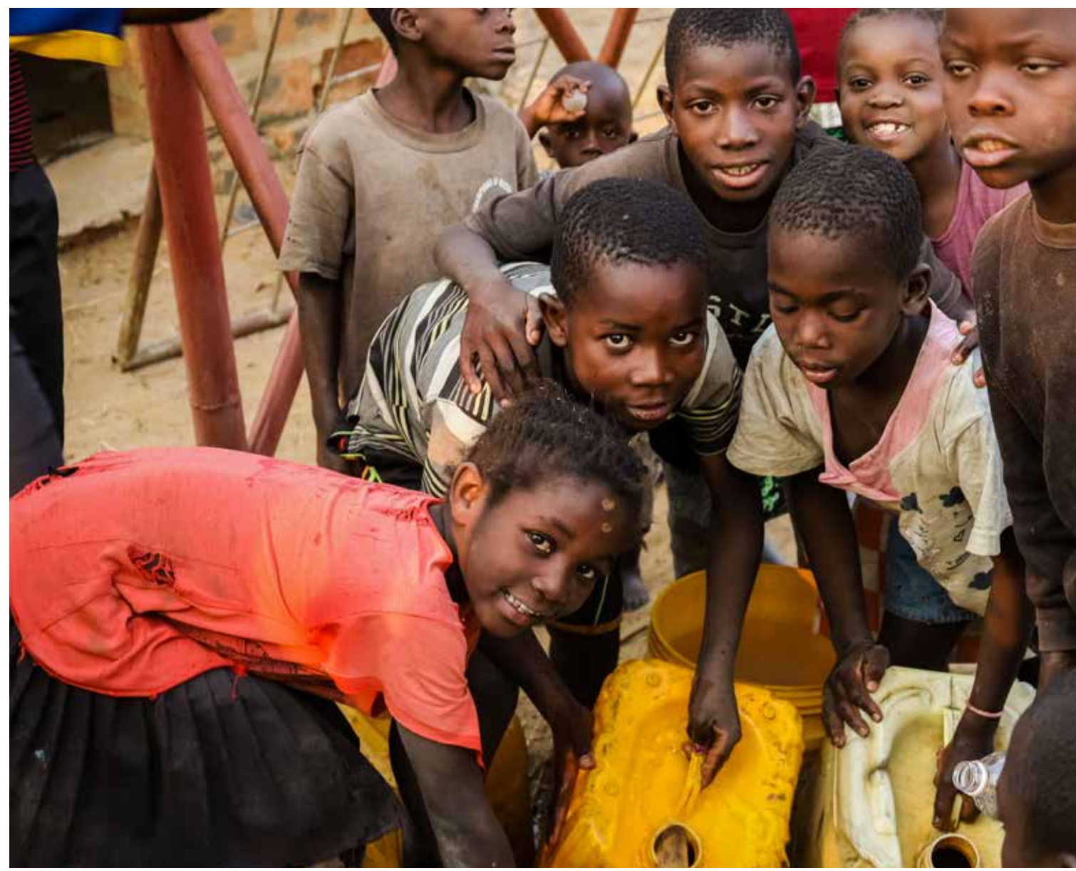
Children enjoy piped water in the village, Photo by Bellah Zulu, Mumbeji, 2018

There was jubilation in Mumbeji community of North Western Zambia after a long running Norway funded project which brought running water to villages was finally handed over to the community and the area water management company, North-Western Water and Sewerage Company.