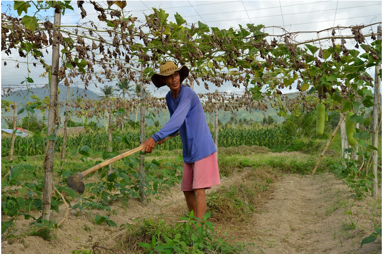
A community member in a vegetable garden, with maize behind him. Diversifying into maize and horticulture is one adaptation strategy

This document is a summary of an impact assessment carried out in the Philippines. Read the full impact assessment: “Developing Climate Services in The Philippines” .