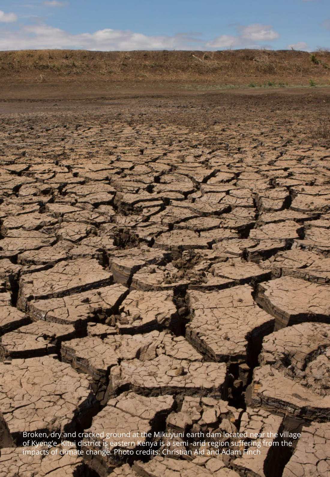
Broken, dry and cracked ground at the Mikuyuni earth dam located near the village of Kyeng'e. Kitui district is eastern Kenya is a semi-arid region suffering from the impacts of climate change.