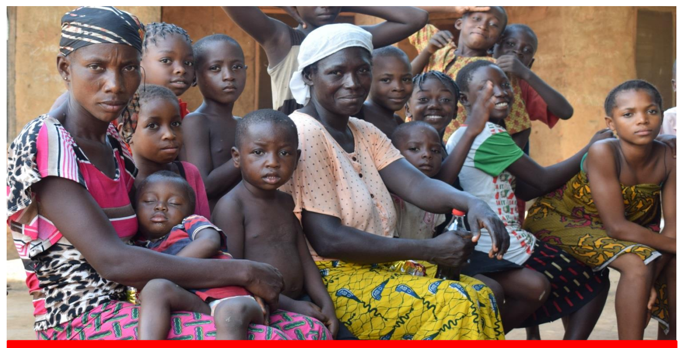
Children under the age of five are the core targets of the Partnership for Improved Child Health Project; women of reproductive age will also be targeted.