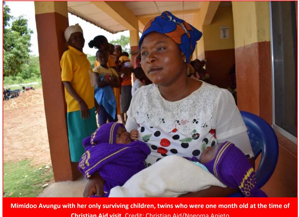
Christian Aid visit.