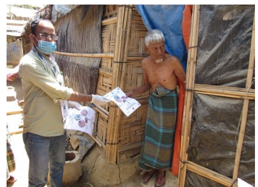
Below: Delivering reliable facts about Covid-19