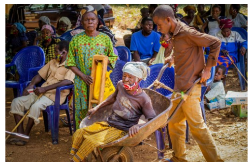
Below: Difficulties of reaching COVID-19 aid, Nigeria

Shutting down civil society access to humanitarian assistance and relief by the state reveals a drive to centralise power and control over relief funds in the interests of powerful allies in government and business. Under cover of Covid-19, power has shifted away from CSOs seen as critical and therefore in need of tighter control by government.