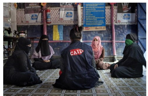
Below: Meeting with Rohingya women, Bangladesh

The study reminds us of the urgent need to promote a vibrant and open civic space to combat poverty and injustice. With our partners and stakeholder communities, we want the learning from our research to be applied in practice. The international donor community must support civil society actors and state institutions to expand and protect civic space and make it more inclusive. This means taking action through programme design, engagement with government and long-term strategic funding. The danger is that if we do not act now then these restrictions will become embedded, as societies emerge from the crisis period of the pandemic.