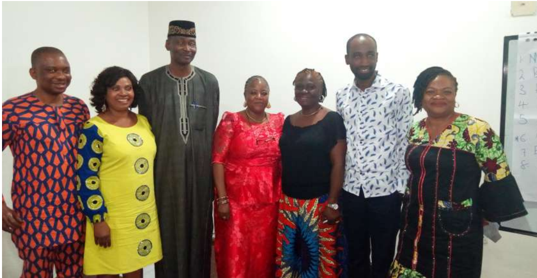
National Steering Committee members - Nigeria

Despite those challenges, the research has succeeded in presenting the views and experiences from a rich diversity of NGO voices in Nigeria, especially from local and national NGOs, whose voices are often not heard clearly enough in research conducted by INGOs. The research provides valuable insights into partnerships and beyond that can assist all humanitarian stakeholders in designing and co-creating strategies to accelerate localisation of humanitarian action.