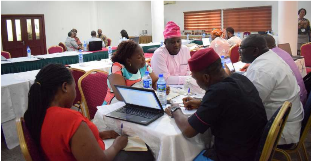
Discussing research findings and recommendations - Nigeria

The partnerships that appeared to be the most likely to support localisation are longer-term; although some good partnership practices were mentioned for short-term partnerships too. Given the protracted nature of the humanitarian crisis in Nigeria, partnerships tended to be longer than in other countries with sudden onset disasters such as floods and earthquakes, and so offered opportunities for partners to develop trust and come to common understandings.